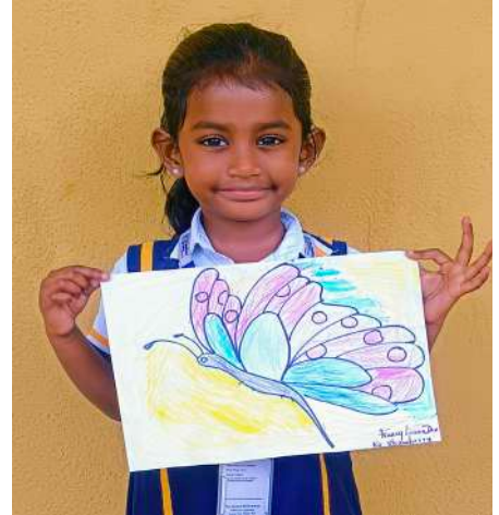
FRANCY LIANA DEV K2 STRAWBERRY