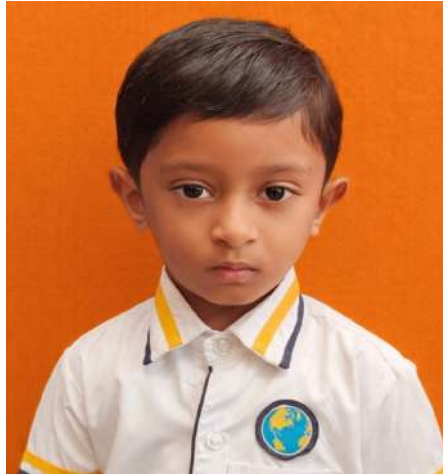
CHARVK RK K1 KIWI